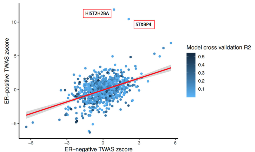
FIGURE 1 Scatter plot comparing the transcriptome-wide association study z scores in ER+ and ER- patients

We tested whether the imputed gene expression-breast cancer associations differed by subtype using GWAS summary statistics from a case-only analysis, which specifically compared ER+ with ER- breast cancer patients (see Section 2 for details), scanning through