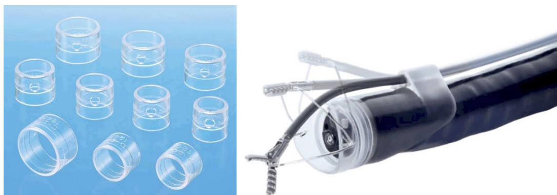
Image 2. Distal attachments. Left: Caps (Olympus, Tokyo, Japan). Right: Endolifter (Olympus, Tokyo, Japan).

There is some evidence to suggest that cap-assisted EMR significantly shortens procedure time in comparison with EMR or ESD without a cap in removing rectal tumours. 48,49 There are as yet no head to head trials comparing cap versus non-cap assisted ESD. Hoods are a type of cap with a tapered tip that can be used to elevate mucous membranes following the initial incision to aid with submucosal dissection. Again, comparative trials are not present, and evidence is limited to case studies. 50