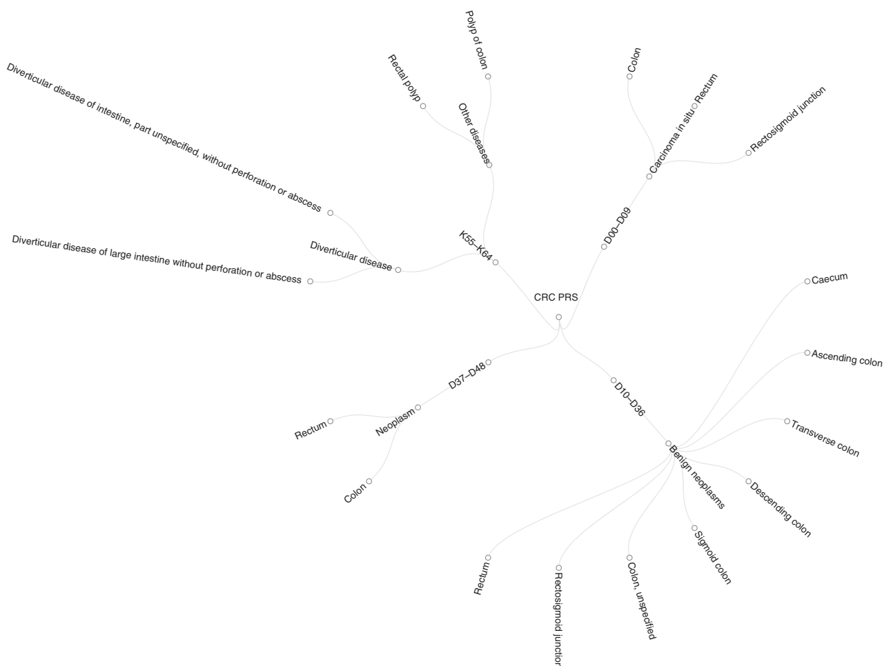
Fig. 3 TreeWAS results of the associations between weighted polygenic risk scores of colorectal cancer and other diseases in UK Biobank. The blue circles represent the disease nodes associated with colorectal cancer polygenic risk score (CRC PRS). D00–D09: in situ neoplasms, D10–D36: benign neoplasms, D37–D48: neoplasms of uncertain or unknown behaviour, K55–K64: other diseases of intestines.

codes (PheCODEs). Being an instrumental variable approach the described PheWAS framework and the use of CRC PRS minimised the influence of reverse causality and confounding effects that are common in observational studies such as the DTB. A PheCODEs based PheWAS conducted as part of the Michigan Genomics Initiative explored associations between several PRSs of CRC and other phenotypes and reported results consistent with our PheWAS analyses [46]. A recent study used the PRS of CRC to scan its association with 15 other cancers and did not find significant associations [47]. In this study, we used recent GWAS findings to construct a genetic measure of CRC and adopted a phenome-wide association framework using the UKBB, a repository with a big enough sample size and high quality, curated, disease record-linkage to national cancer registry, death registry and hospital inpatient systems. The phenome-wide association framework included two methods, which accounted for the differences in scope and structure of phenome scanning and used different methods of ICD hierarchy. Furthermore, to test the robustness of our results, we performed a series of sensitivity analyses.