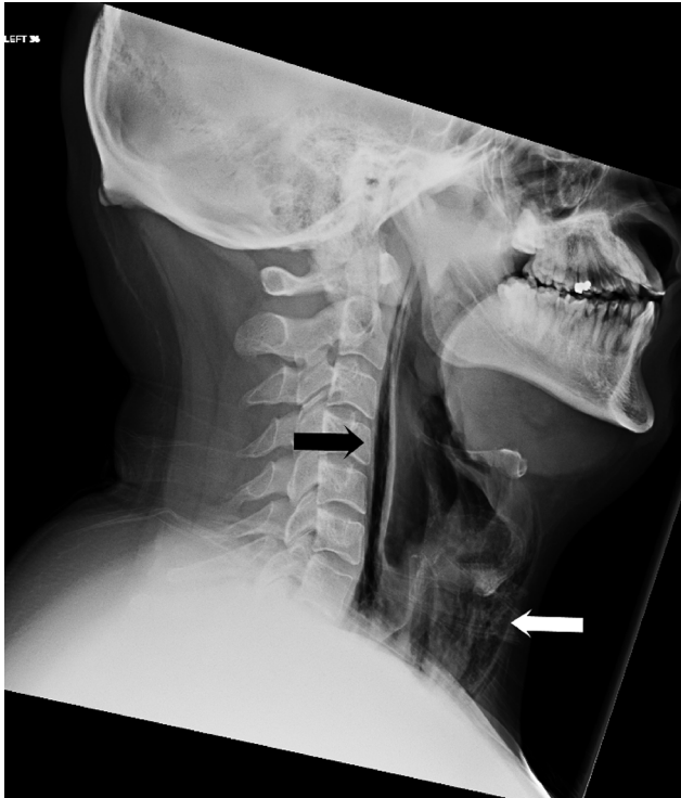
Figure 1 Lateral soft tissue neck radiograph with narrow window setting shows streaks of air in the retropharyngeal region (black arrow) and extensive surgical emphysema in the neck anterior to the trachea (white arrow).

subcutaneous emphysema and spontaneous pneumomediastinum, Boerhaave's syndrome carries a much higher morbidity and mortality and requires prompt and aggressive surgical treatment. 3 As the oesophagus ruptures in Boerhaave's syndrome, the gastric contents transgress into the mediastinum resulting in overwhelming mediastinitis, respiratory failure, shock, sepsis and potentially death. 3 In contrast, pharynx or pyriform sinus perforation can usually be managed non-surgically and cured without significant morbidity due to its low rate of respiratory or intrathoracic complication. 4 Patients with well-contained leak and no significant complications can be treated conservatively with enteral/parenteral feeding and broad spectrum antibiotics.