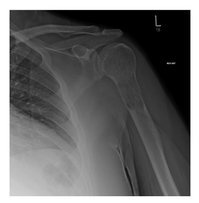
Figure 1: X-ray showed lytic lesion and pathological fracture of left proximal humerus. Plain radiographs of the left.