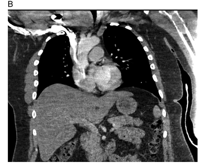
Figure 3: CT Chest with contrast showed an enlarged right lobe thyroid gland with retrosternal extension causing compression and deviation of trachea (arrow). (A) axial view. (B) coronal view. CT scan.

any suspicious characteristics. A fine needle aspiration cytology (FNAC) specimen of the solitary nodule was reported as a Thy2 with features consistent with a simple nodule. The investigations were arranged by the patient's general medical practitioner who reassured the patient without the input of secondary services.